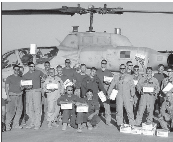
Operation Gratitude thanks Rogers Gourmet Coffee & Tea for their long-time generous support--they have ensured that every Operation Gratitude Care Package sent (430,000 and counting!) has a package of coffee for our Soldiers, Sailors, Airmen and Marines!

known for her mainstream drama novels, has a floor to ceiling display of her notable books. Standing along the red carpet, anticipating the entrance of the honorees, the group of media photographers and writers was abuzz. Many locals were on hand to attempt to collect autographs Continued on page 7