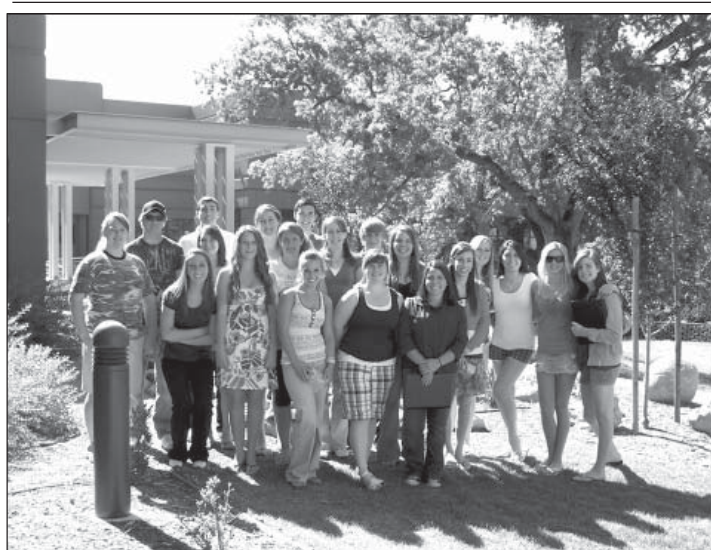
ROP students from Argonaut and Amador High Schools.