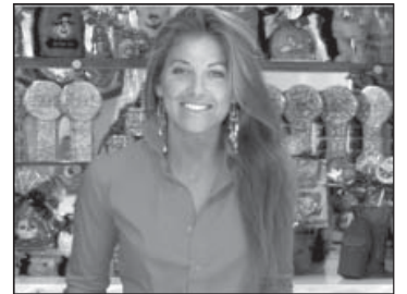
Dylan's Candy Bar tour, one of many interesting destinations.

Finetune your culinary skills at www.epicurious.com/video where experts demo everything from making chicken dishes to mixing drinks. Also available are a wealth of Recipes and Menus, Article & Guides, and Tips. Great technique videos: watch videos on disjointing a chicken, boning a cooked fish, making an omelet, and much more! A fun, easy to use site. You can read great recipes from Bon Appetit , and